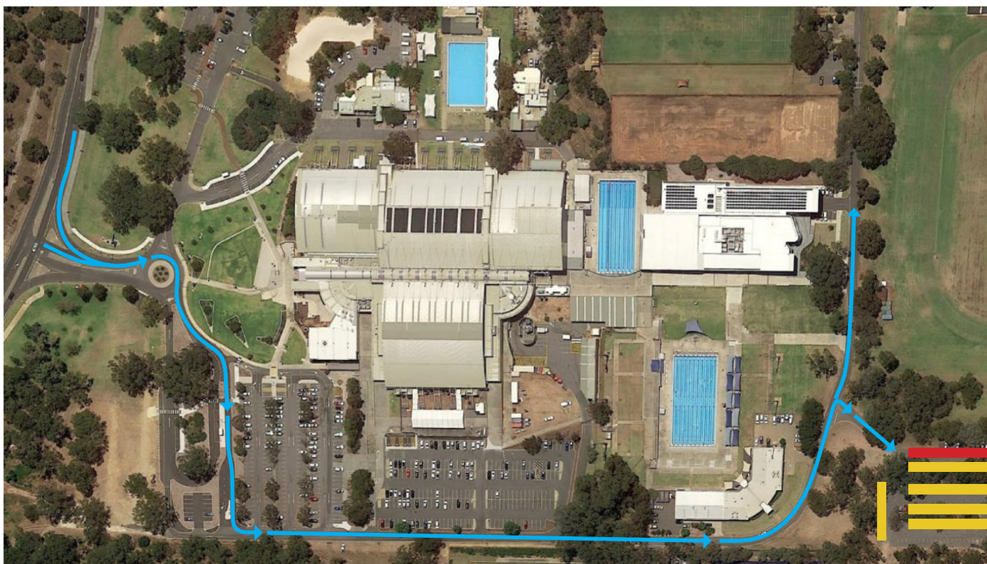
No drop off in red zone. Please park in top areas of car park to allow other egressing buses through

No school groups should enter or exit via the main HBF Stadium entrance, however, parents must enter this way.