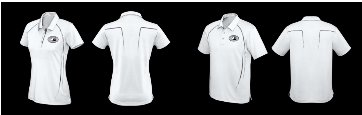
LADIES POLO SHIRT